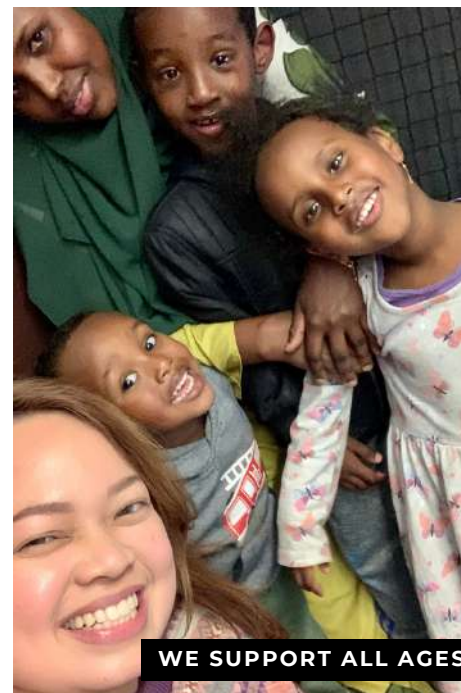
WE SUPPORT ALL AGES