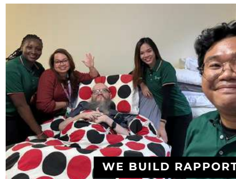
WE BUILD RAPPORT