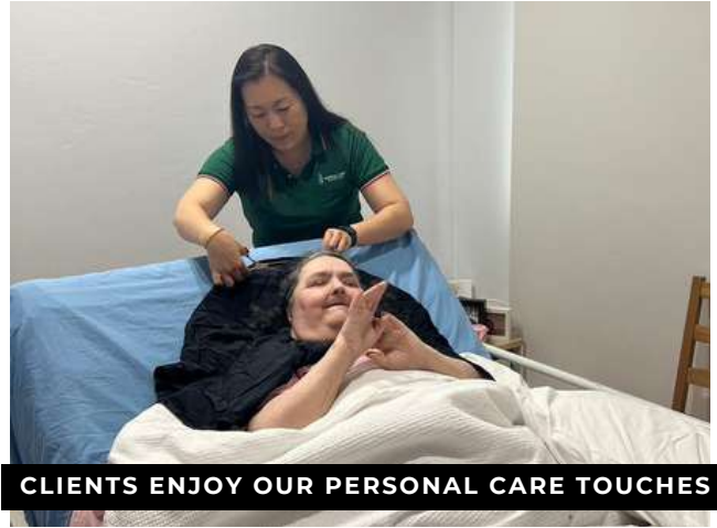
CLIENTS ENJOY OUR PERSONAL CARE TOUCHES