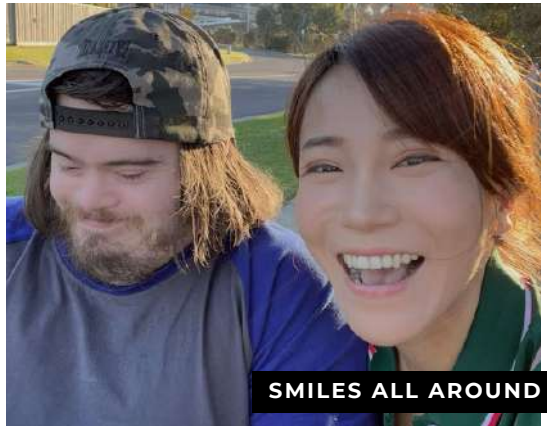
SMILES ALL AROUND