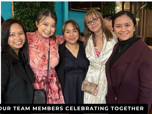
OUR TEAM MEMBERS CELEBRATING TOGETHER