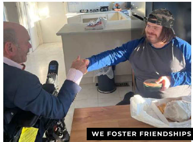
WE FOSTER FRIENDSHIPS