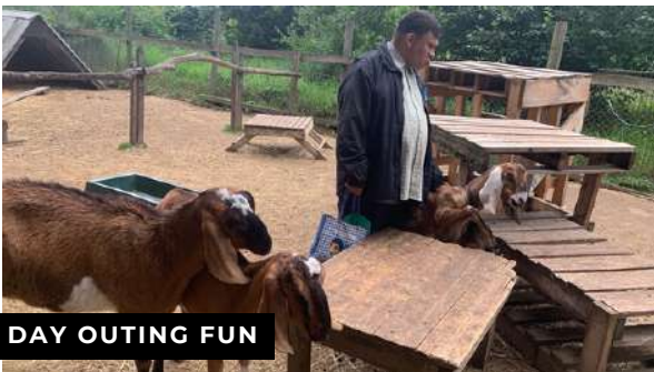
DAY OUTING FUN

As we continue to grow and expand our services, we remain committed to upholding our core values of compassion, dignity, and respect. We are excited about the future and look forward to creating more opportunities for individuals to thrive in a home-like setting.