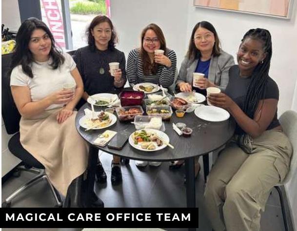
MAGICAL CARE OFFICE TEAM