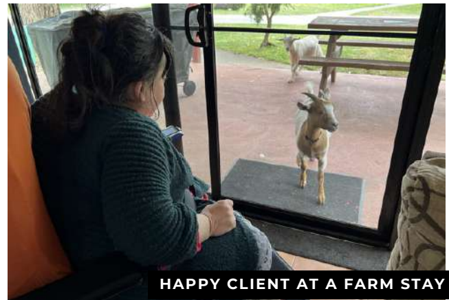
HAPPY CLIENT AT A FARM STAY