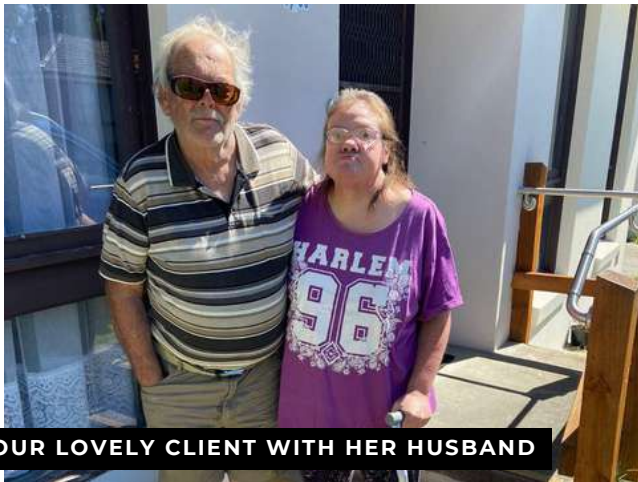
OUR LOVELY CLIENT WITH HER HUSBAND