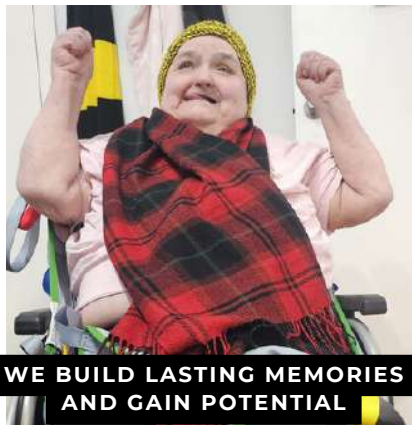
WE BUILD LASTING MEMORIES AND GAIN POTENTIAL

Your level of care does not go unnoticed.