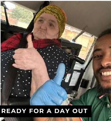
READY FOR A DAY OUT