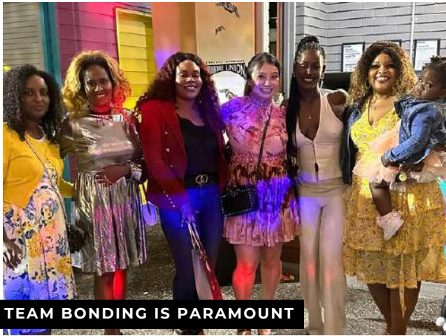
TEAM BONDING IS PARAMOUNT