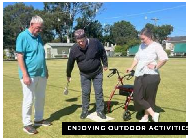
ENJOYING OUTDOOR ACTIVITIES