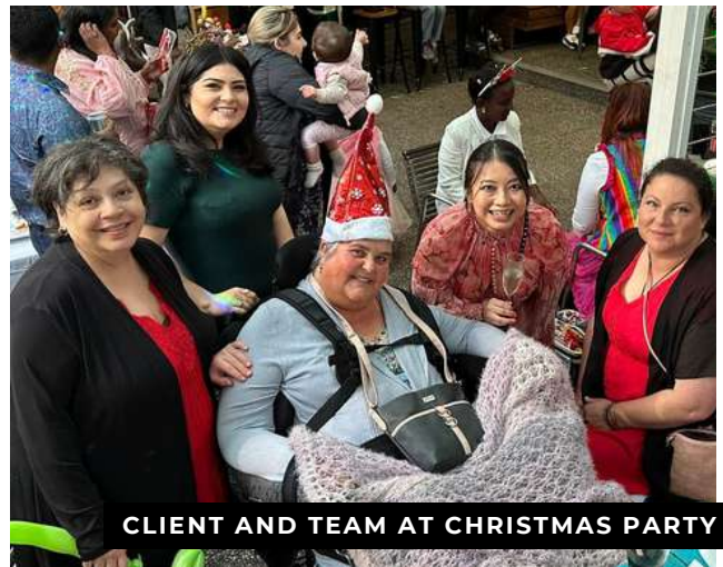
CLIENT AND TEAM AT CHRISTMAS PARTY