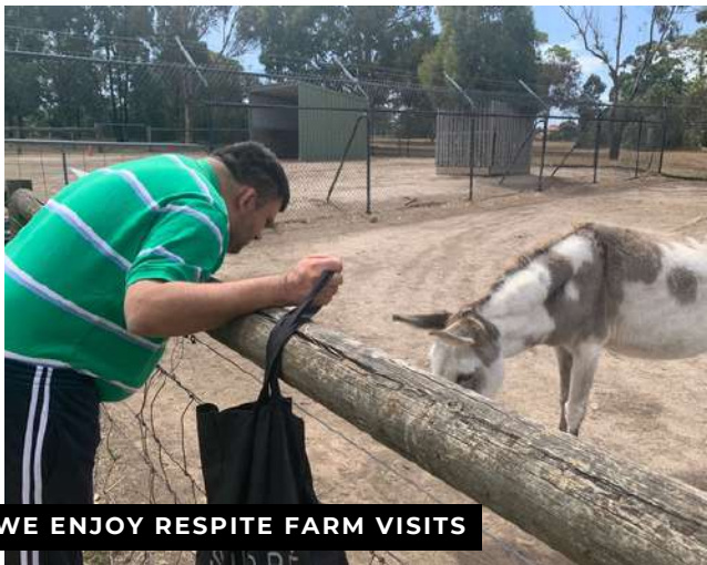
WE ENJOY RESPITE FARM VISITS