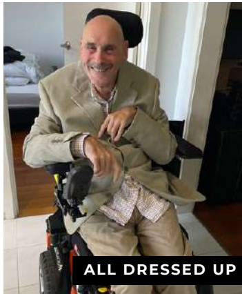
ALL DRESSED UP